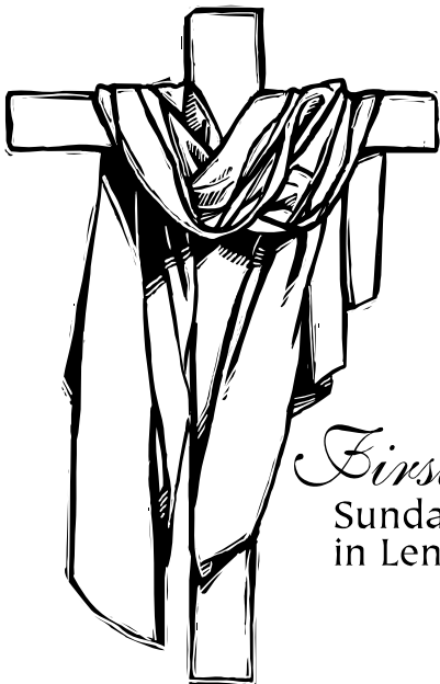
First Sunday in Lent